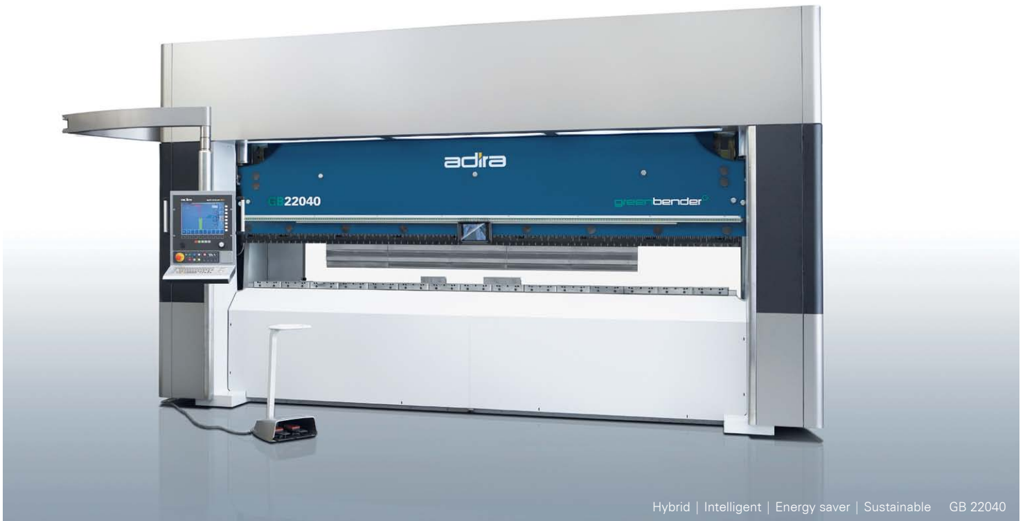
Hybrid | Intelligent | Energy saver | Sustainable GB 22040