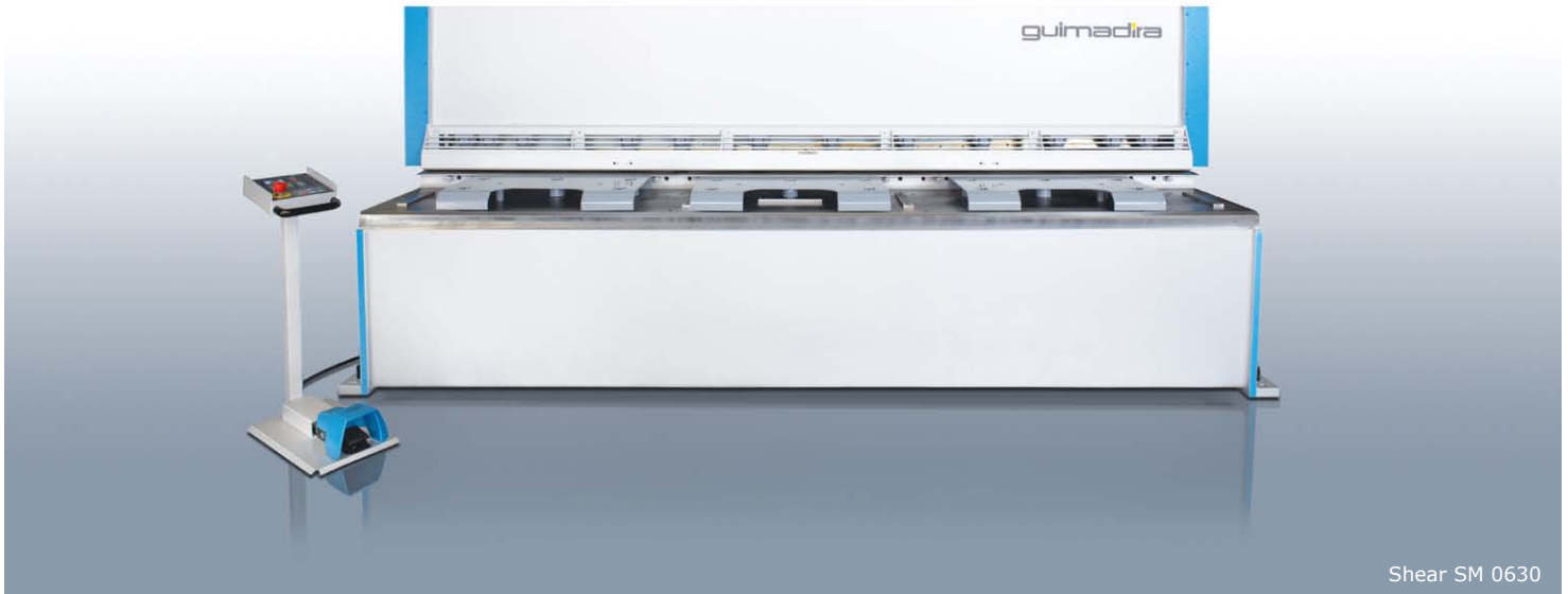
Shear SM 0630