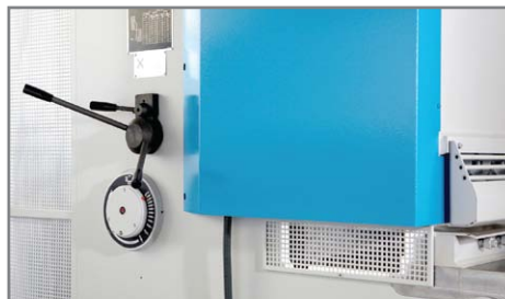
Blade clearance adjustment