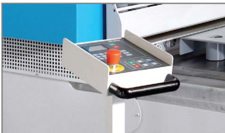
Movable control station with integrated CN

All data are approximate. Specifications are subject to changes without notice. Shown specifications may vary from country to country. For different configurations consult your Adira specialist.